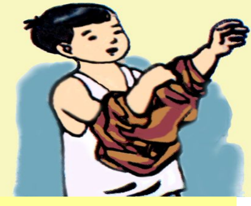
He gets dressed.